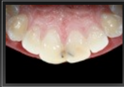
Fig 2. Palatal view