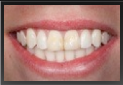
Fig 1. Preoperative central incisors with discoloured direct composite veneers