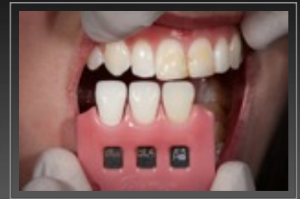
Fig 3. The shade was between A1 and BL4